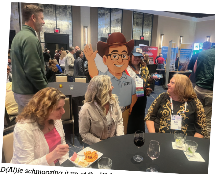
D(AI)le schmoozing it up at the Welcome Reception

MARCH 15 – 18, 2026 JW MARRIOTT NASHVILLE NASHVILLE, TENNESSEE