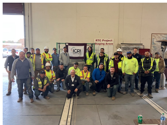
All participants and Subject Matter Experts gather for a group photograph following completion of the training.