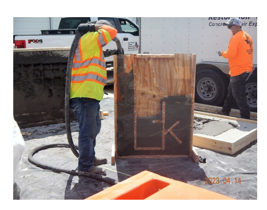
Concrete forming and pumping demonstration.