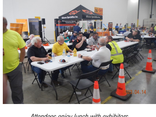
Attendees enjoy lunch with exhibitors.