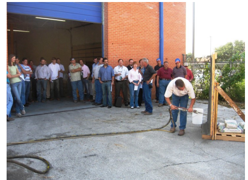
Table top exhibits are available! Exhibits will include a location to set up a display and advertise your company and/or products. As an exhibitor, you will have the chance to network with ICRI members and event attendees, and to perform your own product

Join us to network with industry leaders and manufacturers in the concrete repair industry! By attending the 2023 NTX Mega Demo Day, you'll have an opportunity to learn about the challenges faced every day in the repair and maintenance of concrete. You'll have the chance to witness live demonstrations of proper installation techniques, equipment, tools, and new technologies for concrete repair.