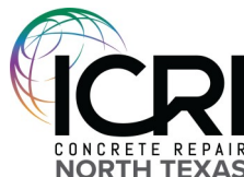
TABLE TOP EXHIBITS

More info on attached registration form.