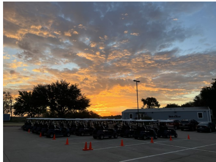
Sunrise over Waterchase