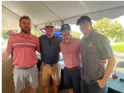
1st Place Team (Prosoco)