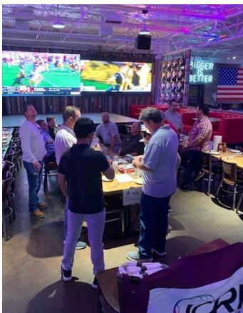
Cold drinks and good times at Longhorn Icehouse.