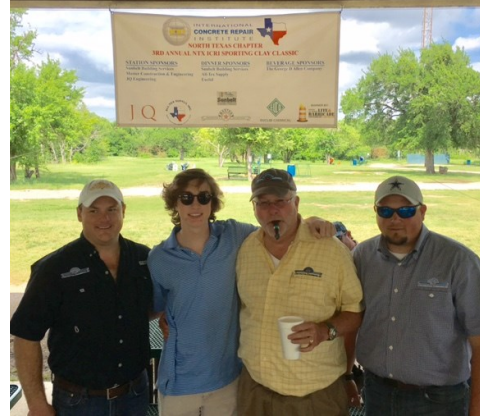
2nd Place Team (Master Construction)