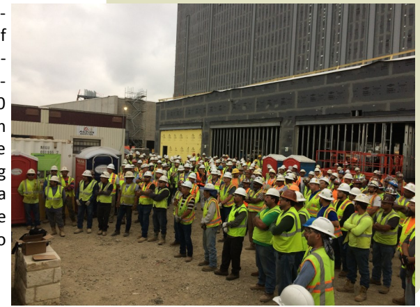
Workers at the Irving Music Factory site attend a presentation by the George D. Alan Company.